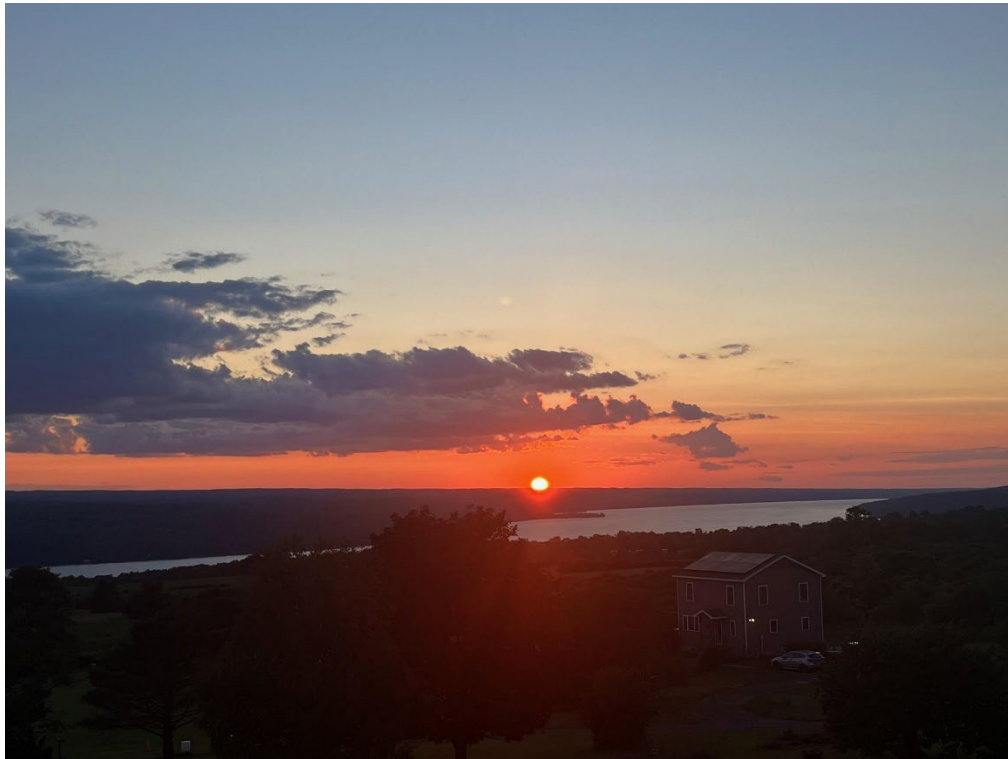
Cayuga Lake